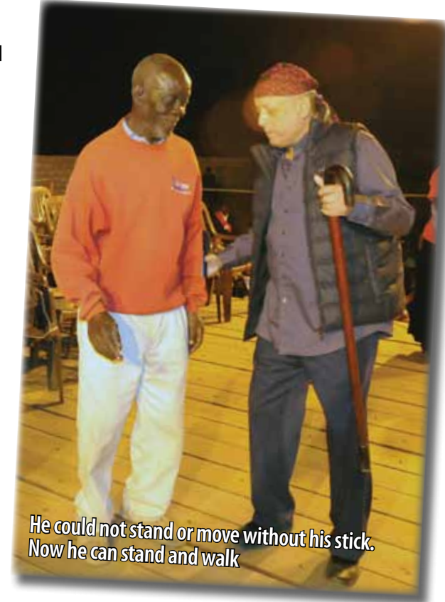
He could not stand or move without his stick. Now he can stand and walk