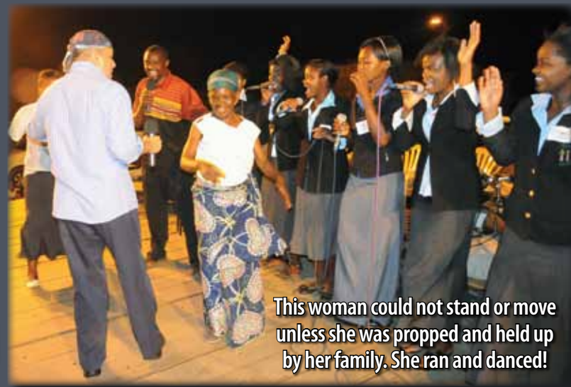
This woman could not stand or move unless she was propped and held up by her family. She ran and danced!

includes preaching to bad people in bad places! We have to set our faces like flint and preach the Crucified and the Risen Christ to the people no matter what, because the Gospel of Jesus is their only Hope of Deliverance from the clutches of the devil. It was a rough week, but Praise God we came out of it in