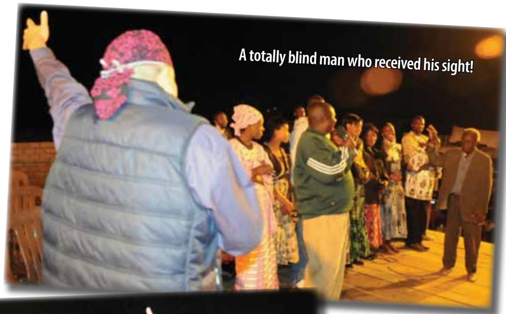
A totally blind man who received his sight!