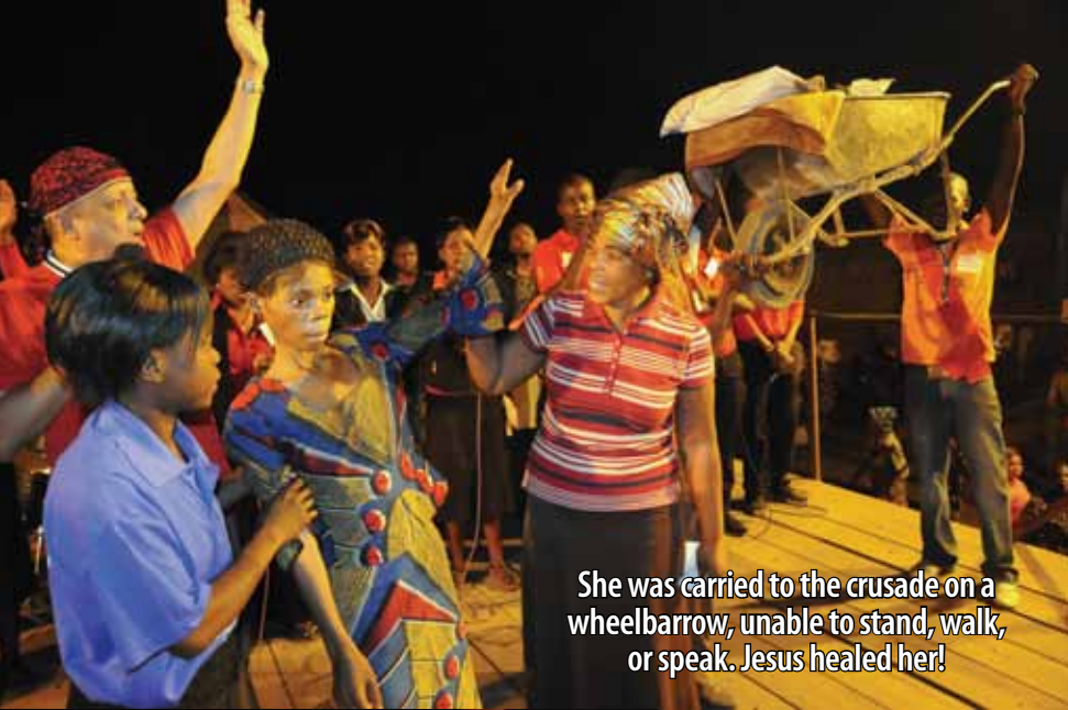
She was carried to the crusade on a wheelbarrow, unable to stand, walk, or speak. Jesus healed her!