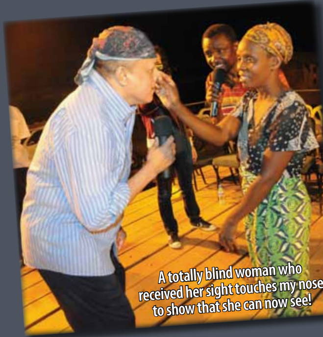
A totally blind woman who received her sight touches my nose to show that she can now see!