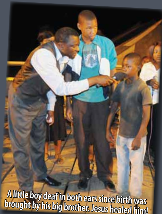
A little boy deaf in both ears since birth was brought by his big brother. Jesus healed him!