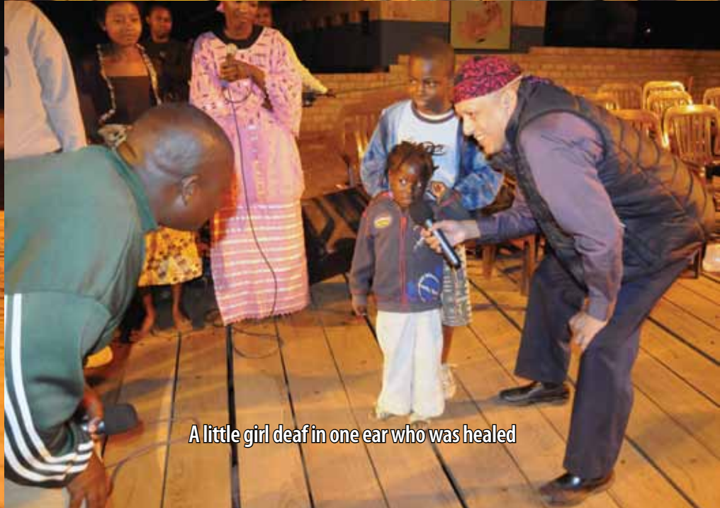
A little girl deaf in one ear who was healed