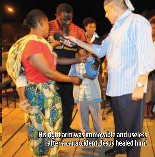
His right arm was immovable and useless after a car accident. Jesus healed him!