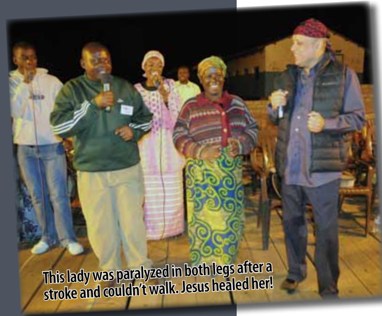
This lady was paralyzed in both legs after a stroke and couldn't walk. Jesus healed her!