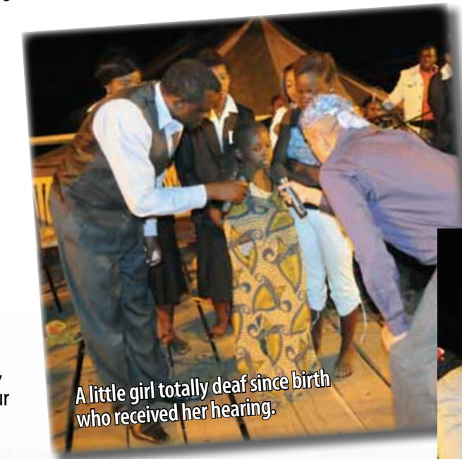
A little girl totally deaf since birth who received her hearing.