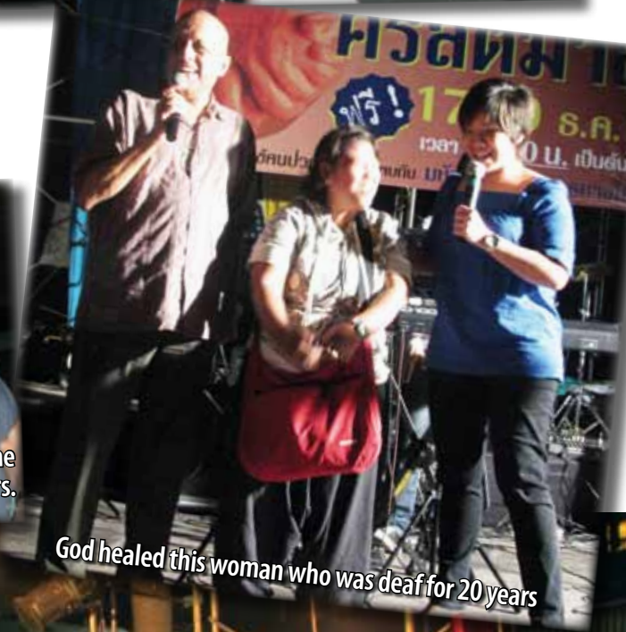
God healed this woman who was deaf for 20 years