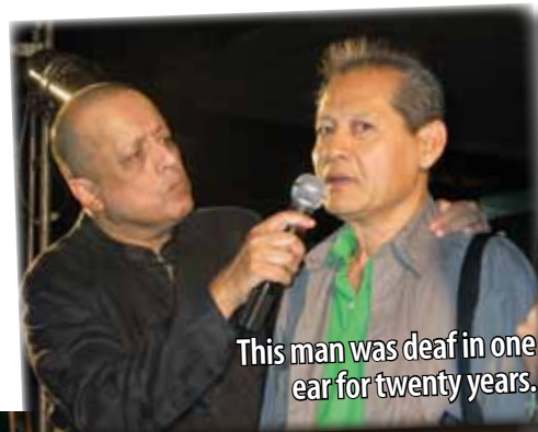
This man was deaf in one ear for twenty years.