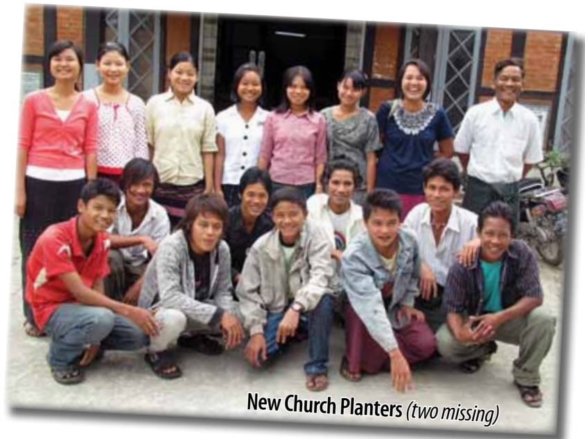
New Church Planters (two missing)

So far, we have been able to plant 178 churches in unreached areas all over Asia. Our latest group of church planters has