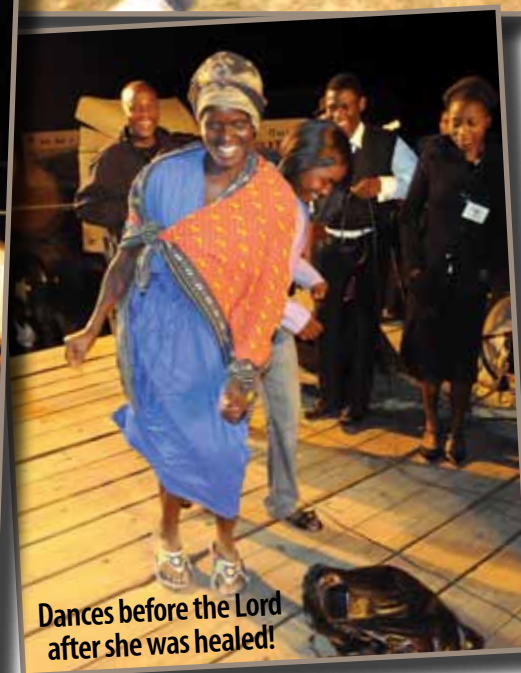
Dances before the Lord after she was healed!