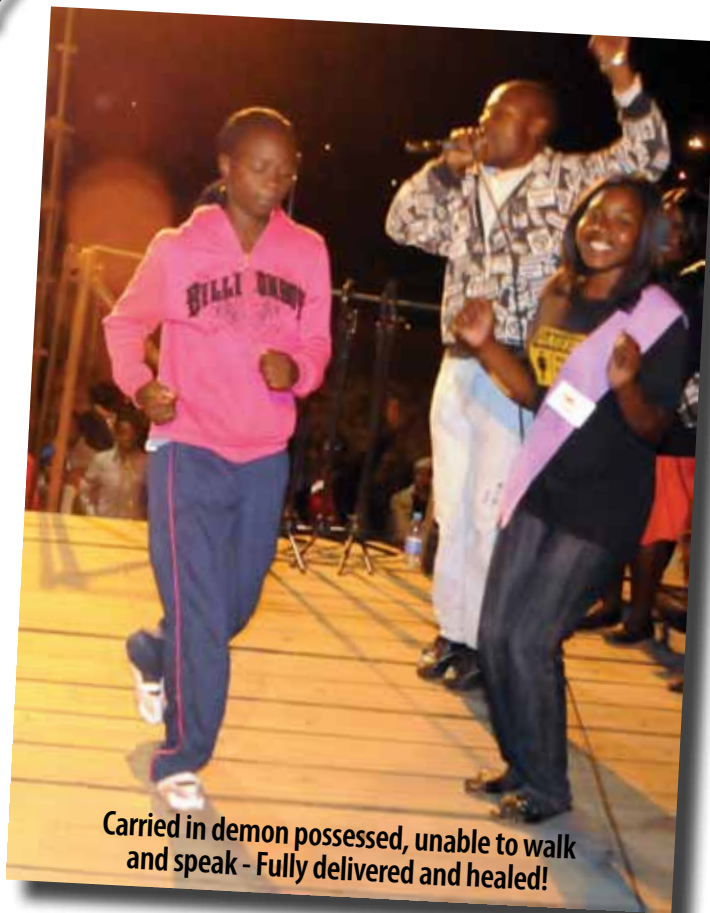
Carried in demon possessed, unable to walk and speak - Fully delivered and healed!