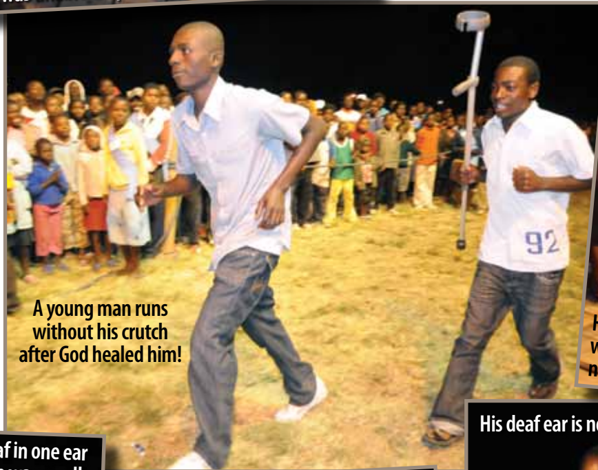
A young man runs without his crutch after God healed him!