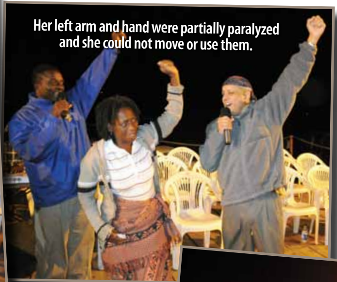
Her left arm and hand were partially paralyzed and she could not move or use them.