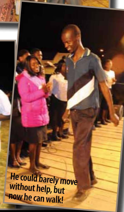
He could barely move without help, but now he can walk!