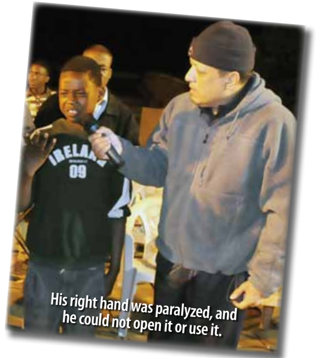
His right hand was paralyzed, and he could not open it or use it.

November 10-11, 2010 Upper Room Prayer Gathering Youngstown, OH, USA