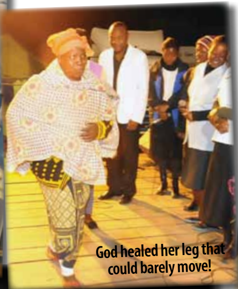
God healed her leg that could barely move!

Some of the people who braved the freezing cold and the rain to come to hear the Gospel!