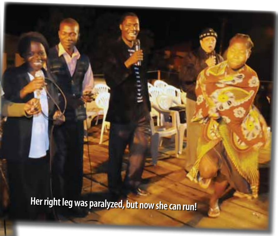
Her right leg was paralyzed, but now she can run!