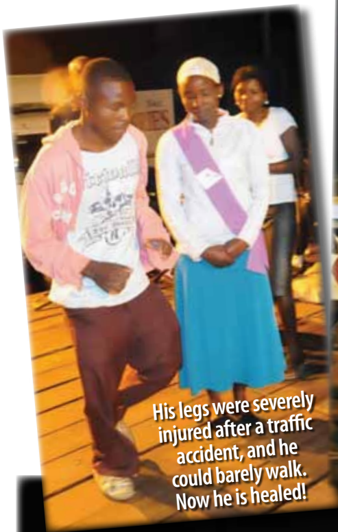
His legs were severely injured after a traffic accident, and he could barely walk. Now he is healed!

I have been ministering in churches in the US in between overseas trips and have been blessed to see people Saved and Healed in these meetings. Many people have also been stirred up for the Gospel. In all, we have been blessed to see much good fruit out of this.