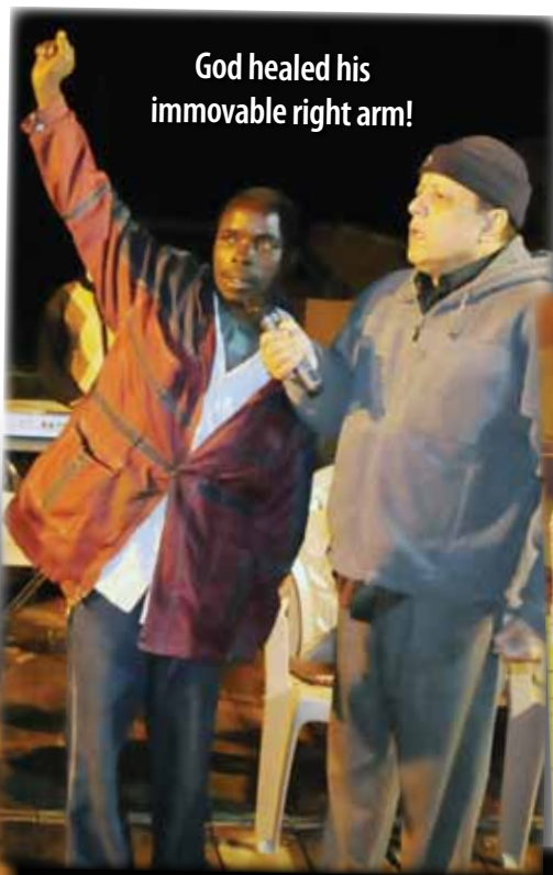
God healed his immovable right arm!