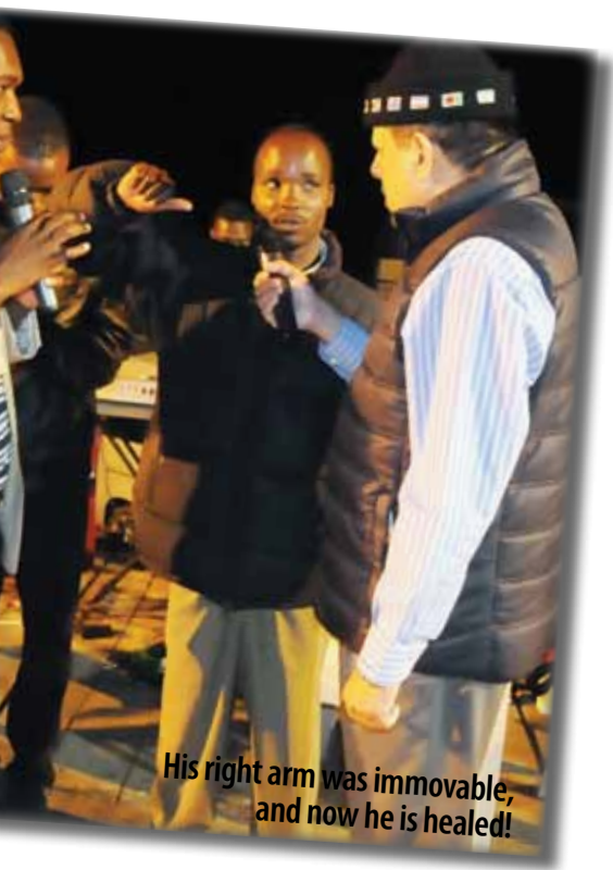
His right arm was immovable, and now he is healed!