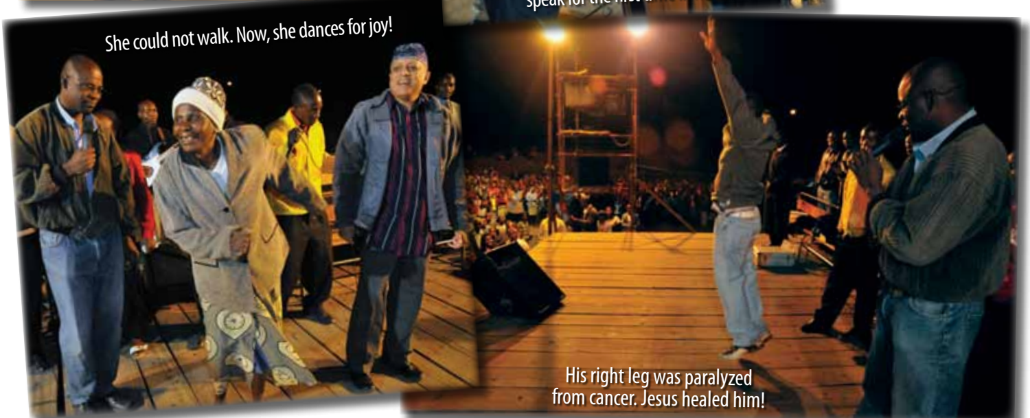
She could not walk. Now, she dances for joy!