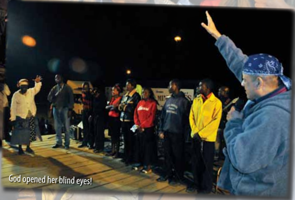
God opened her blind eyes!