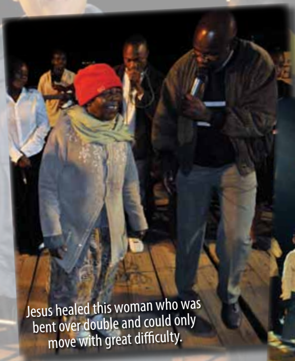
Jesus healed this woman who was bent over double and could only move with great difficulty.