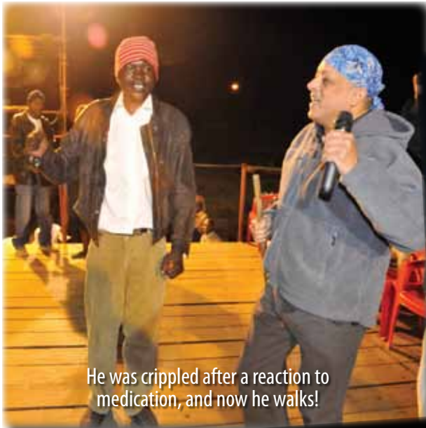
He was crippled after a reaction to medication, and now he walks!