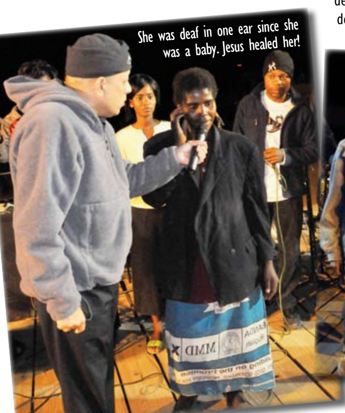
She was deaf in one ear since she was a baby. Jesus healed her!

Many were also delivered from demons. When I called upon the mighty Name of our Lord Jesus, demon-possessed in the crowd fell to the ground screaming and the devils came out of them. One night, a group of Muslim fanatics came to the crusade. When they saw the demons coming out they got frightened and left in a hurry.