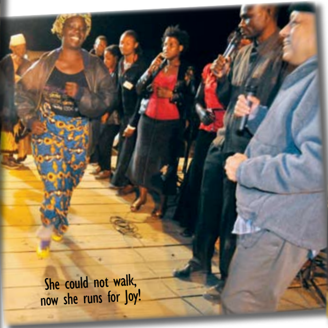
She could not walk, now she runs for Joy!