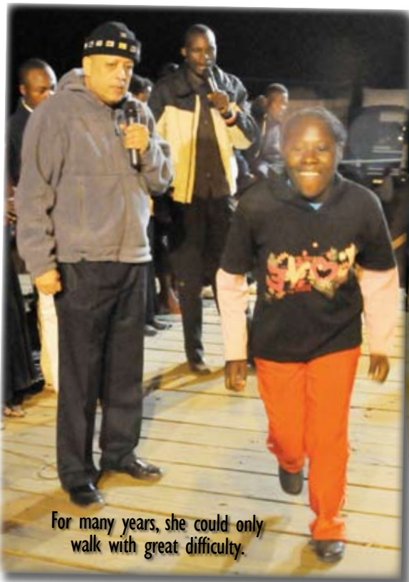
For many years, she could only walk with great difficulty.

What is privilege it is to serve Him! I often think of how far the Lord has brought me, from so far away out of the world of Islam, "We who were far have been brought near by the Blood of Jesus!" And not only that, but to have the priceless privilege of carrying this Glorious Gospel of Jesus all across the earth and to see Him sending down His Power and His Glory. Wonder of Wonders! What a privilege! Hallelujah to the Lamb who purchased us with His Blood!! Absolutely priceless!