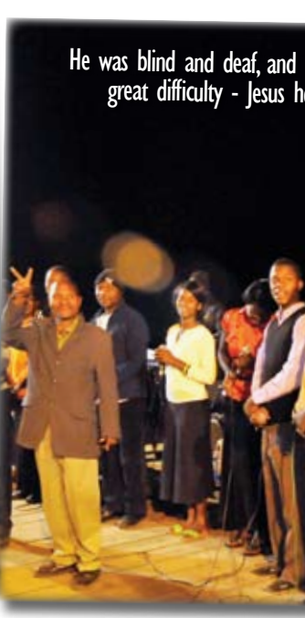
He was blind and deaf, and great difficulty - Jesus h