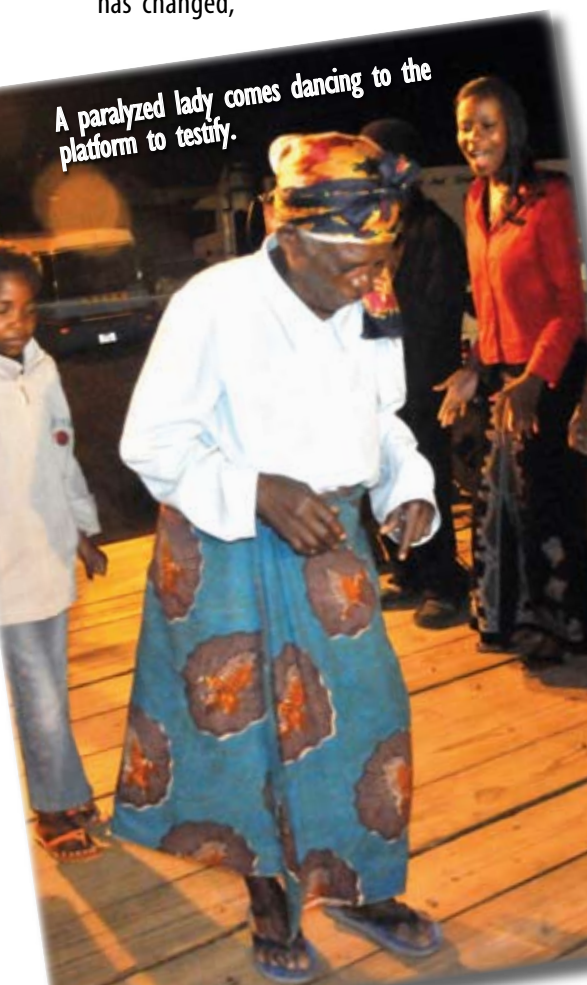
A paralyzed lady comes dancing to the platform to testify.

And, we can say that our Lord Jesus is loved and exalted in this town, far more after this crusade than He was before we came to Chawama!