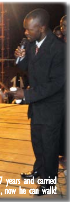
7 years and carried, now he can walk!