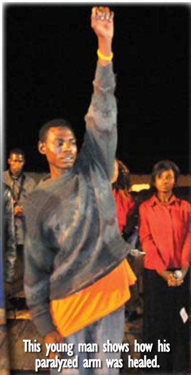
This young man shows how his paralyzed arm was healed.