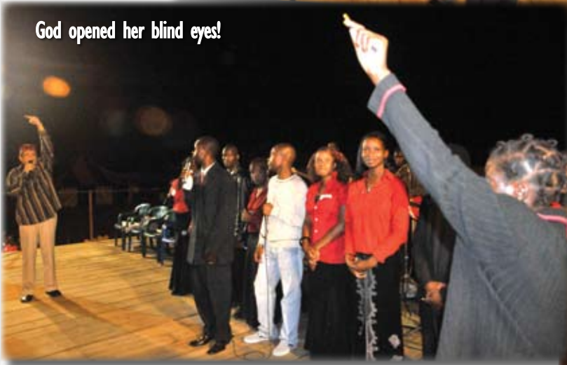
God opened her blind eyes!