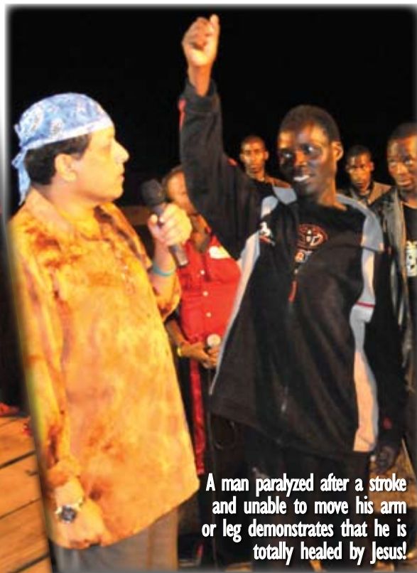
A man paralyzed after a stroke and unable to move his arm or leg demonstrates that he is totally healed by Jesus!