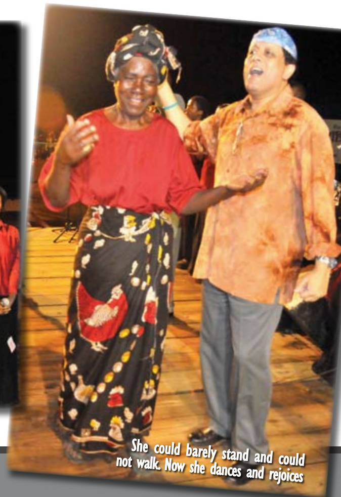
She could barely stand and could not walk. Now she dances and rejoices