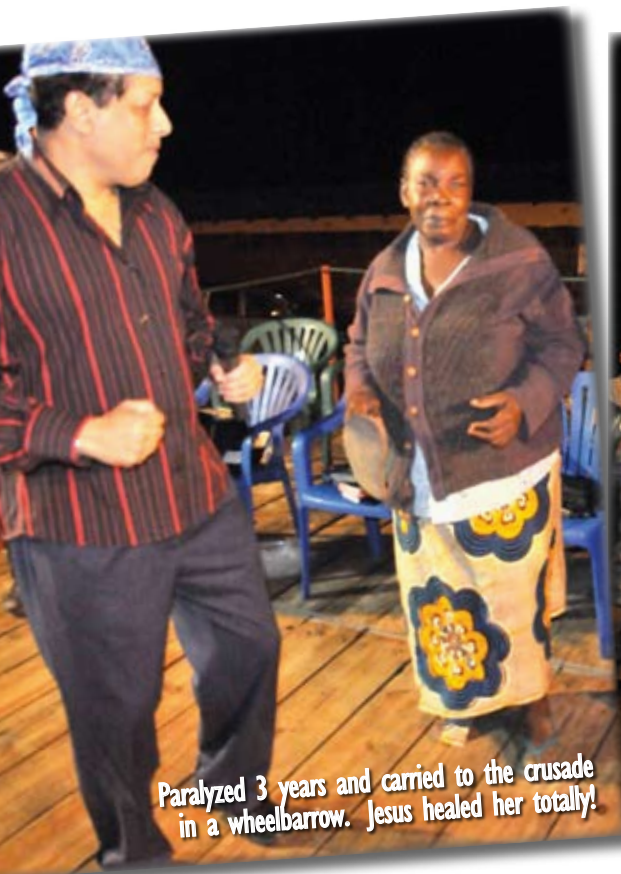
Paralyzed 3 years and carried to the crusade in a wheelbarrow. Jesus healed her totally!