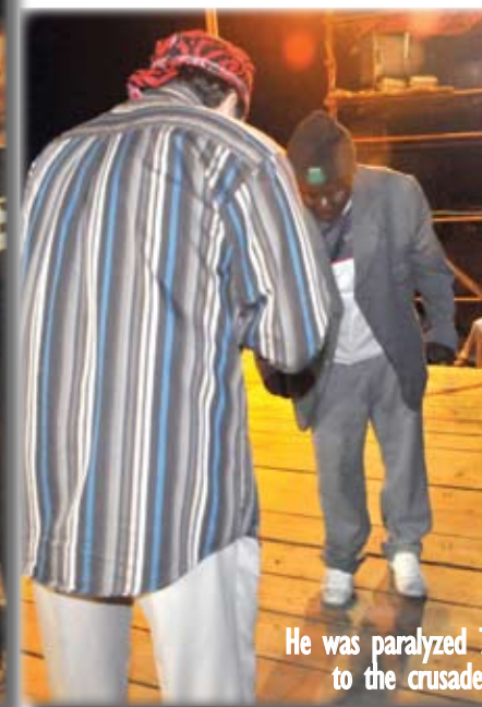
He was paralyzed to the crusade