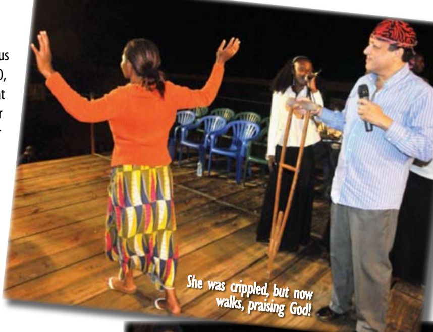
She was crippled, but now walks, praising God!