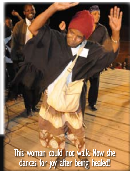
This woman could not walk. Now she dances for joy after being healed!