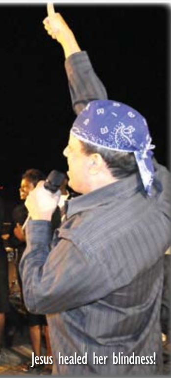
Jesus healed her blindness!