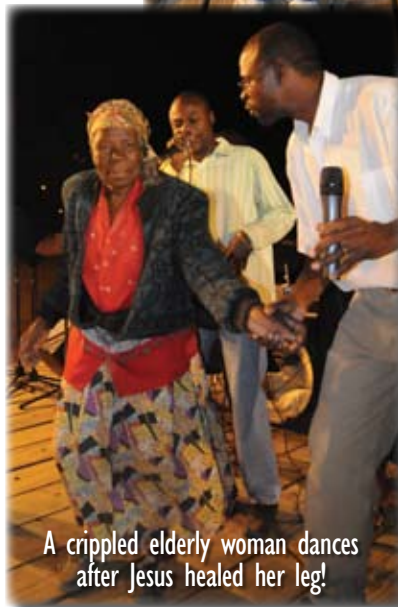
A crippled elderly woman dances after Jesus healed her leg!