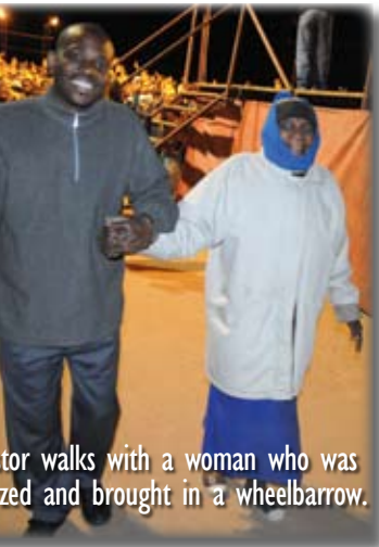
tor walks with a woman who was zed and brought in a wheelbarrow.

"...it pleased God by the foolishness of preaching to save them that believe." 1 Corinthians 1:21