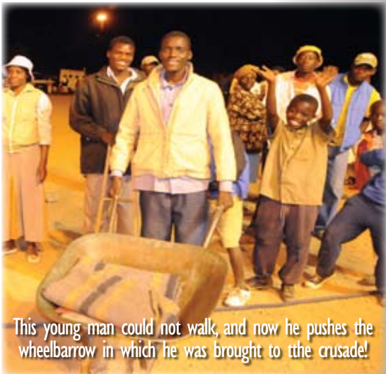
This young man could not walk, and now he pushes the wheelbarrow in which he was brought to the crusade!