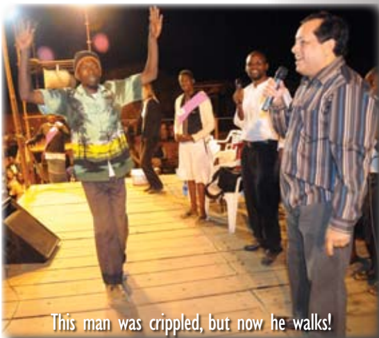
This man was crippled, but now he walks!