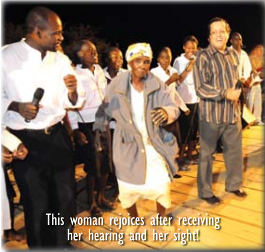
This woman rejoices after receiving her hearing and her sight!

This is the fruit that remains! All glory to Jesus for all that He has done!