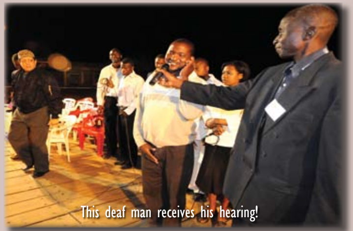
This deaf man receives his hearing!

crusade by his granddaughter. Jesus healed him, and now he can now walk and run!