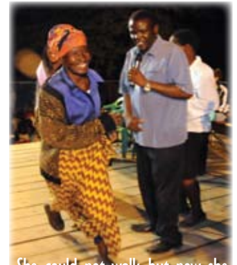
She could not walk, but now she is healed and runs full of joy!