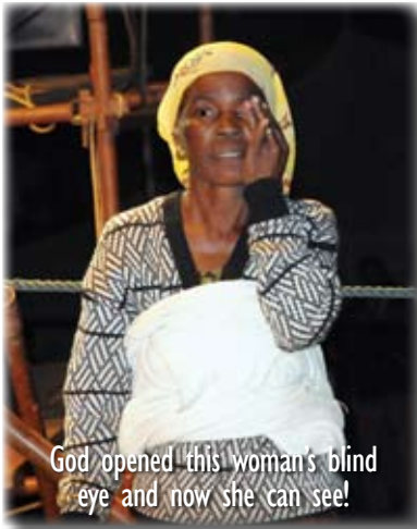
God opened this woman's blind eye and now she can see!