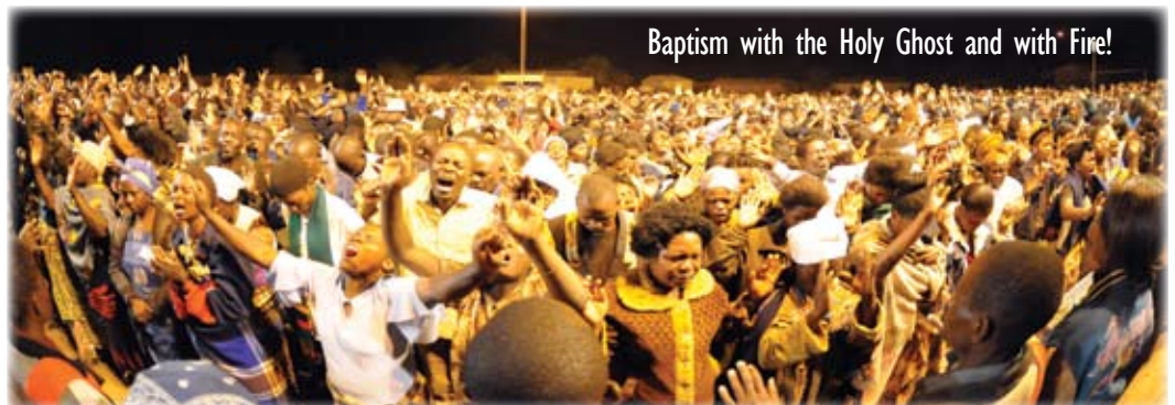
Baptism with the Holy Ghost and with Fire!