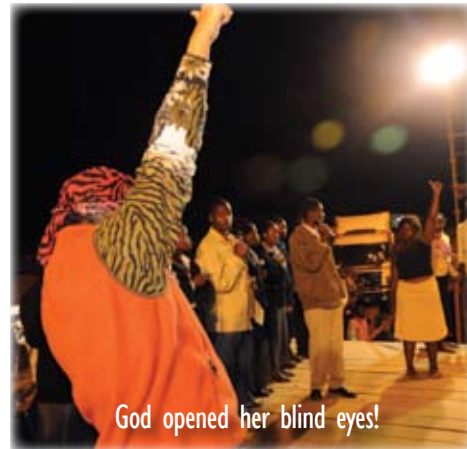
God opened her blind eyes!