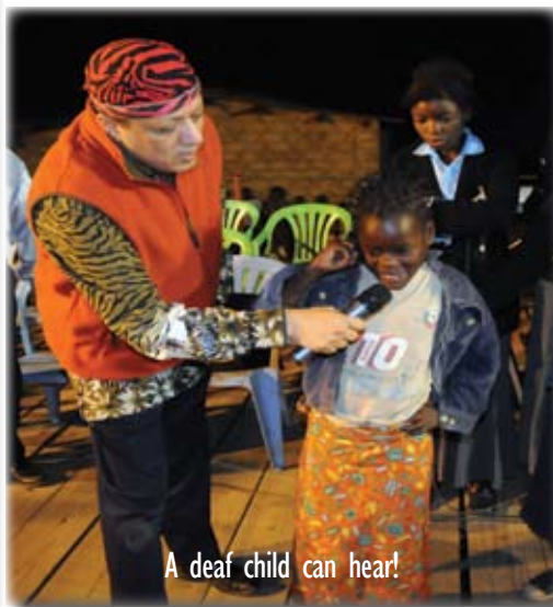
A deaf child can hear!