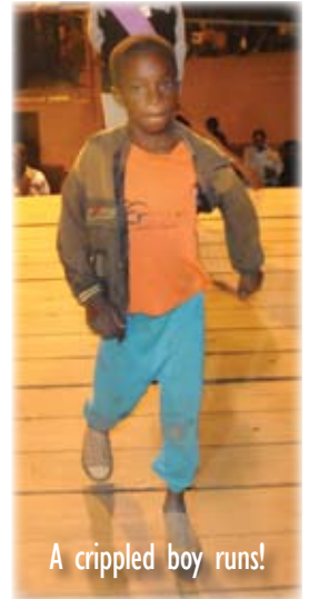
A crippled boy runs!