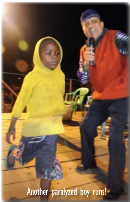
Another paralyzed boy runs!

"Praise The Lord! I ran out of time yesterday to post so today will have to do. I have been doing a lot of thinking which can be bad at times. Sometimes we can think our way right into a mess. I have been pondering this: What is the most important thing that I have learned from my trip to Africa? I was very moved by a lot of really powerful things. I saw the blind recover their sight. I saw the deaf hear again. There was definitely a ton of excitement. I saw thousands baptized in the Holy Spirit and they received without anyone coaching them. Imagine that! The lesson that provided me with the answer did not happen until we were on our way home. I was sitting on a plane reading a