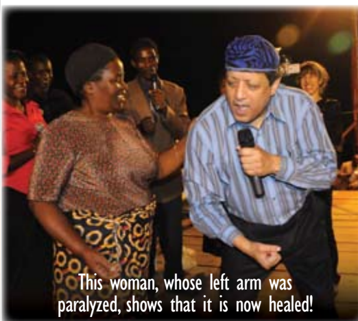
This woman, whose left arm was paralyzed, shows that it is now healed!