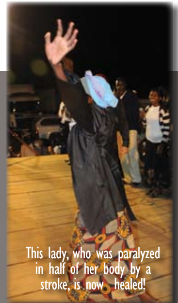
This lady, who was paralyzed in half of her body by a stroke, is now healed!

Augsut 24, 2008 Word of Life Church Birmingham, AL, USA