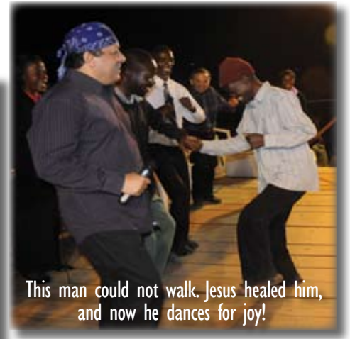
This man could not walk. Jesus healed him, and now he dances for joy!