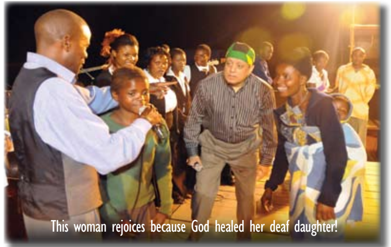
This woman rejoices because God healed her deaf daughter!