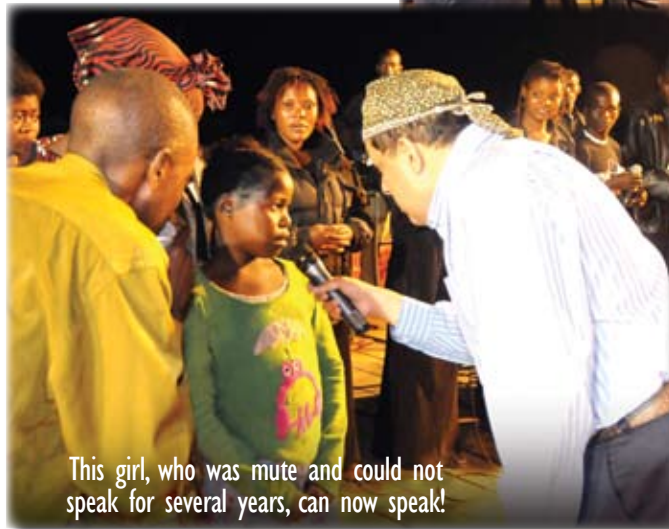
This girl, who was mute and could not speak for several years, can now speak!