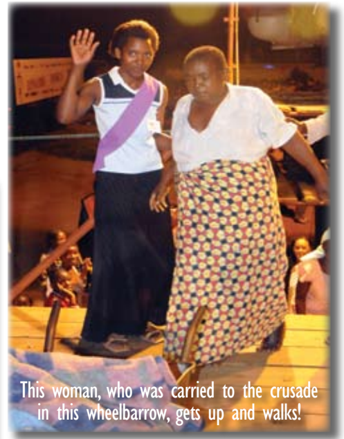
This woman, who was carried to the crusade in this wheelbarrow, gets up and walks!