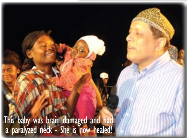
This baby was brain damaged and had a paralyzed neck - She is now healed!