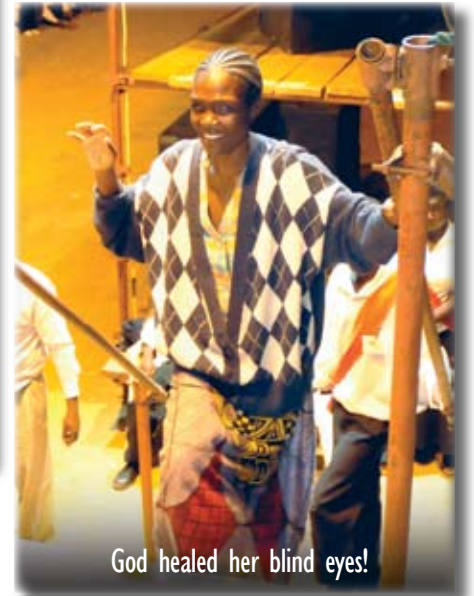
God healed her blind eyes!