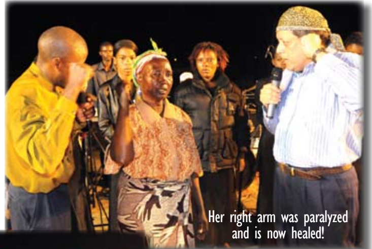
Her right arm was paralyzed and is now healed!

AFRICA: P.O. Box AP73 Harare Airport, ZIMBABWE Tel & Fax: 263.(4).480.467 Email: dynamis@pentecostalfire.zw