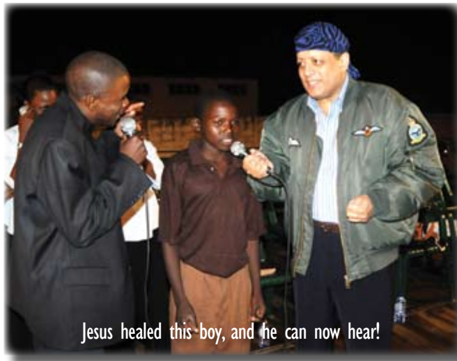
Jesus healed this boy, and he can now hear!

The breakthrough finally came on Sunday night, the last night of the crusade. The power of Satan was broken, and the field was filled with people that had come out to hear the Gospel. A huge multitude received Jesus; including many street toughs and hardened types broke down and