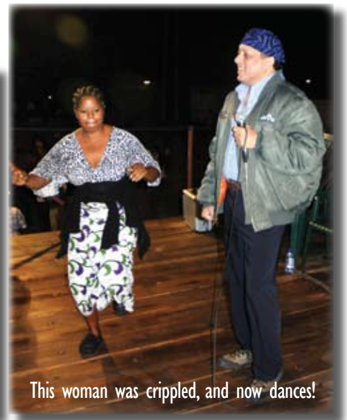
This woman was crippled, and now dances!