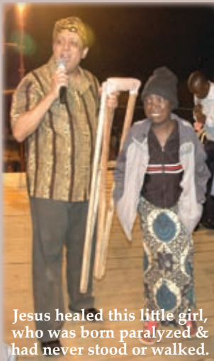
Jesus healed this little girl, who was born paralyzed & had never stood or walked.