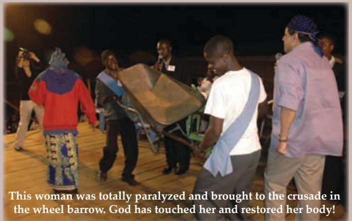
This woman was totally paralyzed and brought to the crusade in the wheel barrow. God has touched her and restored her body!

A mother came carrying her little girl, who had never been able to sit, stand, or walk. Jesus touched her, and she stood up and walked as the crowd shouted and praised God!