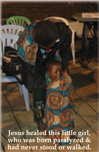
Jesus healed this little girl, who was born paralyzed & had never stood or walked.