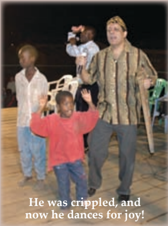
He was crippled, and now he dances for joy!

There were many outstanding miracles that the Lord did for the people of Chawama, and I want to share several that have stayed with me in a special way.