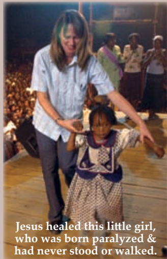
Jesus healed this little girl, who was born paralyzed & had never stood or walked.