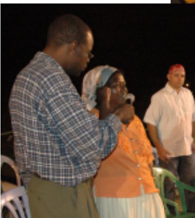
From left: This woman was deaf; now she can hear! This boy was born with deformed and twisted legs—they are now straight!