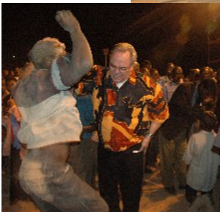
Clockwise from left: This man was possessed by demons. Now he lives free! God touched this blind boy, and now he can see! This man was paralyzed and deaf. God healed him, and now he can walk and hear!

"God also hath highly exalted him, and given him a name which is above every