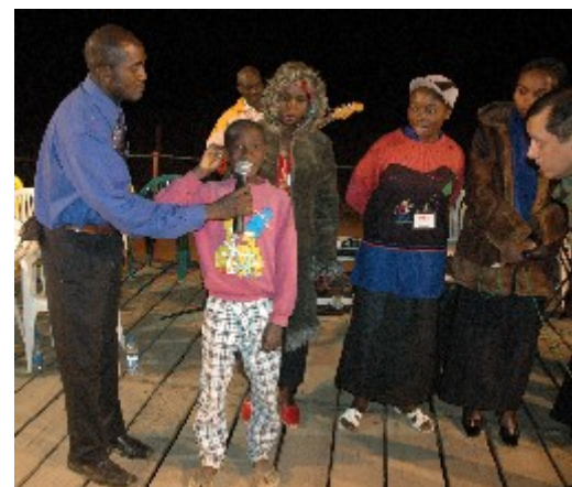
God touched this deaf boy, and now he can hear!