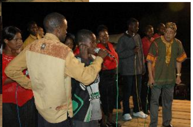
Clockwise from top: This girl was deaf, and now she hears! God touched this girl and opened her deaf ear! This man was paralyzed, and now he runs!