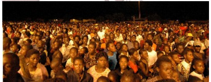
Multitudes came to hear the gospel

Him for all the wonderful things that we had seen Him do. It was a glorious ending; a true Pentecostal "outpouring!"