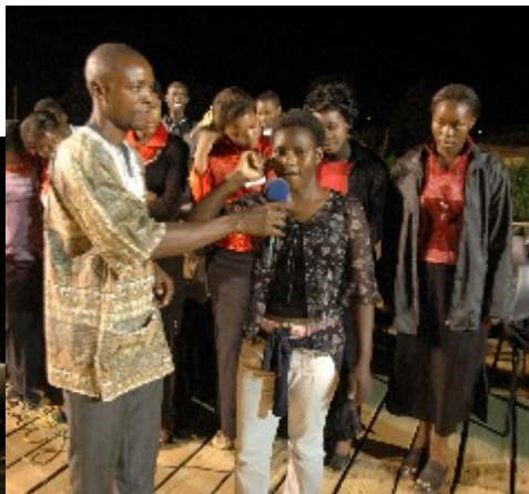
Left to right: This woman was paralyzed and was carried to the meeting. She was healed, and she cries for joy that she can now walk! This girl was deaf and can now hear!

Thank you for your partnership in the Gospel, and for joining your