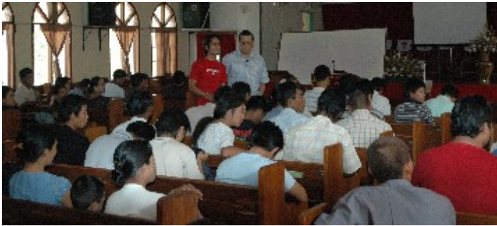
School of Ministry in Asia

digenous believer or church! Everyone was Buddhist, Muslim, or animist. Today, we have three thriving and growing congregations that were started by our Training Center for Church Planter graduates. They are actively spreading the Gospel in that region.