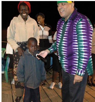
From left to right: This deaf mute boy can now hear and speak! Jesus healed this blind woman, and now she can see!

God did many wonderful and amazing miracles among the people during this week. I remember a 20 year old man born with a deformed and