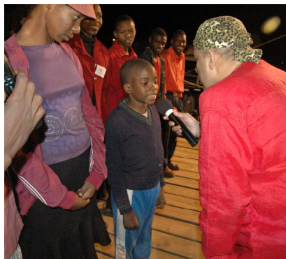
From left to right: This boy's right leg was totally paralyzed since birth, and now he runs! This brother & sister, each born deaf mute, are both healed! This formally crippled woman now dances for joy.

An African Pentecost is an amazing and wonderful thing to be a part of. During this time, many people in the crowd were also healed of a host of diseases and infirmities.