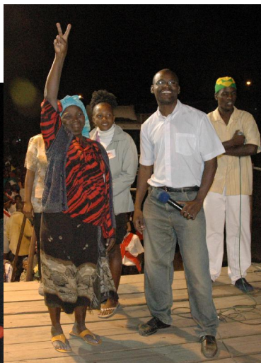
Left to right: This man was blind, and now he sees! This lady was blind, Jesus touched her, and now she can see!