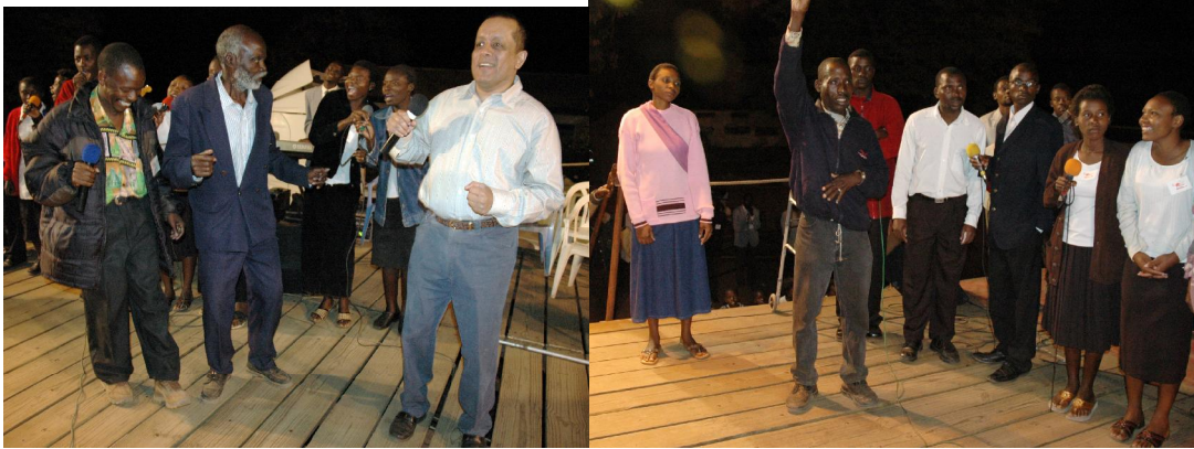
Left to right: God healed this blind & paralyzed man! Man praises God for healing his blind eyes!

The crusade went very well from the beginning. Thousands of people came to hear the Gospel the first night and the crowds grew nightly. By the last meeting, as I mentioned earlier, it was reported that the entire populace attended.