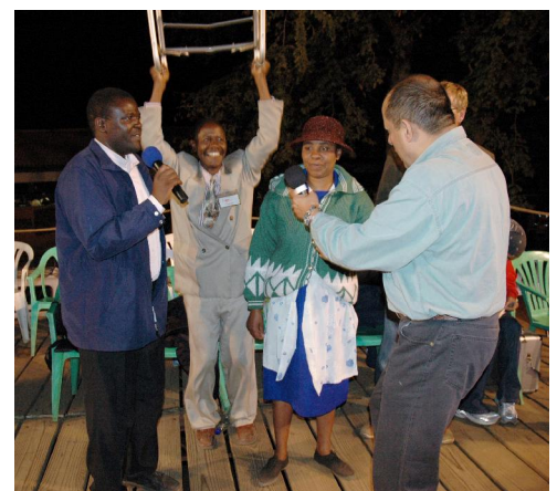
God healed this crippled woman; she can now walk!

We are so blessed to be able to live in a rich country where there is plenty of everything. Even those on welfare in our country have more money than