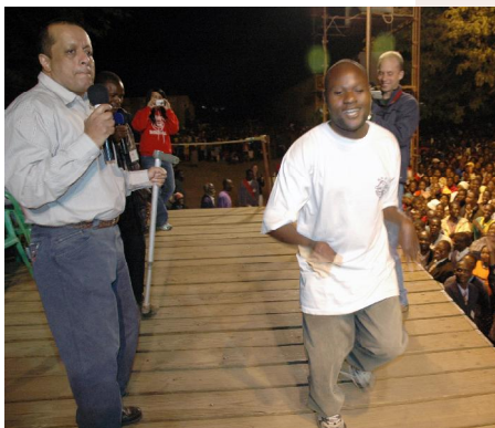
His leg was broken in several places and he could only walk with crutches - now he dances!

We see God doing this everywhere we go, and we see the long-term fruits; churches multiplying, crime rates dropping, and grateful pastors, mayors, and police officers. We go to the townships where the people live and reach them there. Every crusade is properly planned and executed. We have a month long intensive Mobile Bible School, which is a training period for the local churches and leaders, prior to each crusade. Once the crusade has ended, the local churches