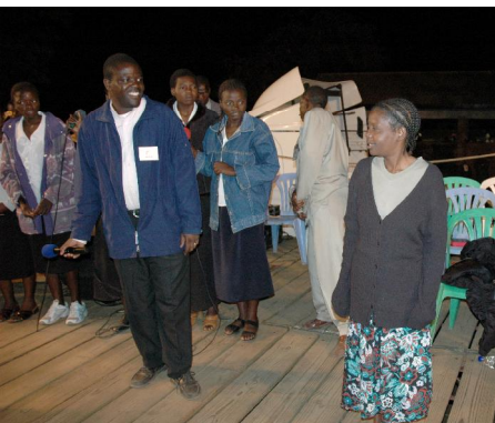
Totally deaf woman can now hear!

Multitudes of people received the Lord Jesus as Lord and Savior, and God confirmed His Word with many signs, wonders, and miracles.