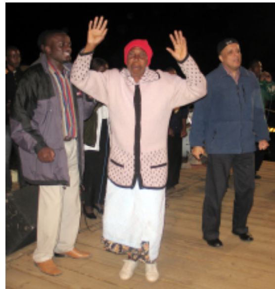
Left to right: This women paralyzed from a stroke is now healed! God restored this young woman's eyes!

Our ministry and our lives are built on what God has given us, not on what we have been able to do on our own. That is why we have never used any aggressive self-promotion or fundraising activities to promote ourselves or our ministry. We inform our partners through our monthly newsletter about our upcoming projects, and we trust that the Lord will lead them as to how He desires them to participate. We do