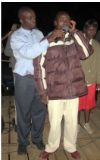
left to right: Deaf boy can now hear! This young man, who could barely walk due to a serious leg injury, now runs!