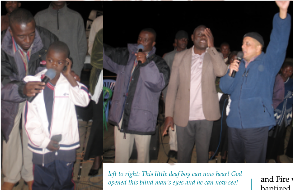
left to right: This little deaf boy can now hear! God opened this blind man's eyes and he can now see!

blessed it is when Jesus is everything and we are nothing!