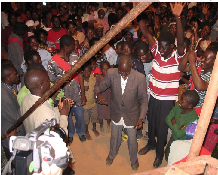
Paralyzed man begins to walk!

One cannot even imagine the misery, the hopelessness, and sense of despair in the lives of the people living in these areas. These are places where government authorities and aid agencies have given up. But, you and I