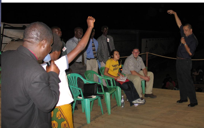
left to right: Deaf & dumb boy started hearing & seeing! God opened her blind eyes!