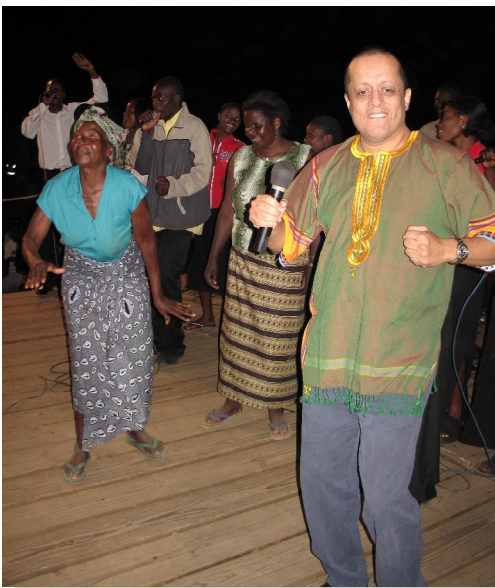
Paralyzed woman begins to dance!