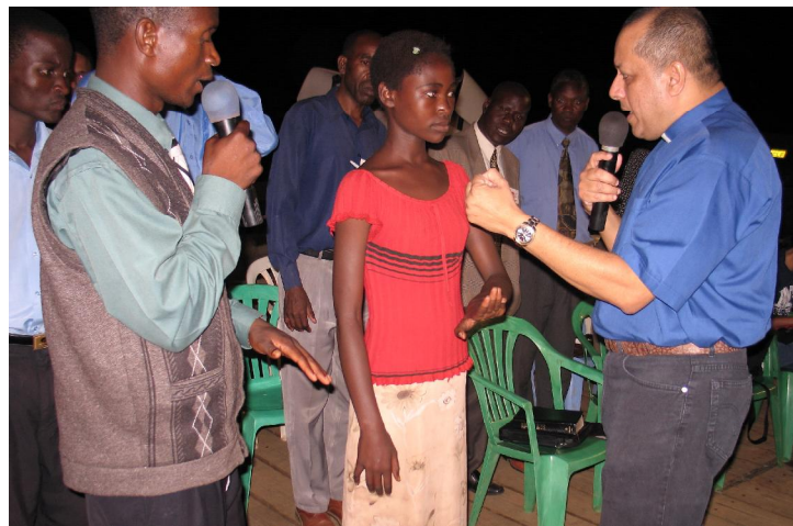
God healed her paralyzed arm!

On the last night of the crusade, thousands received the Baptism with the Holy Ghost