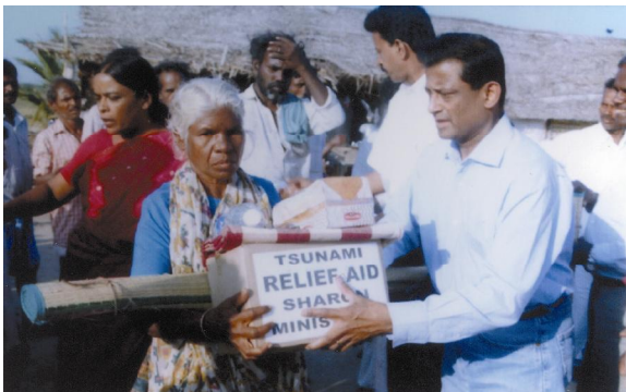
Relief efforts in India