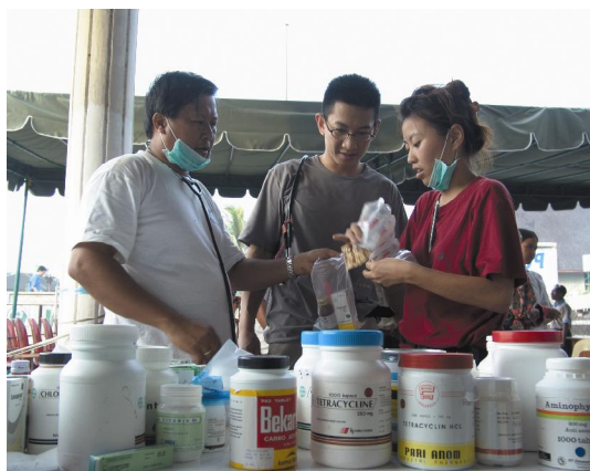
Indonesia: 1 of 6 outdoor clinics

Does this insult your pride? Well, repent, because harboring such attitudes can make you despise people of other nations and make you useless for the Gospel!