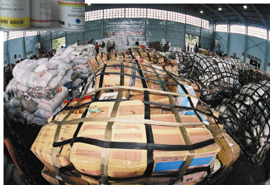
Indonesia: Part of the 14 tons of supplies handed out

At the same time, I am thankful for the many believers, pastors, and churches in America